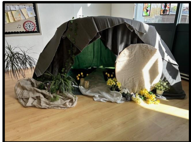
Easter Mass – 17.4.24

"I have come that they may have life, and have it to the full." John 10:10 love ~ respect ~ responsibility ~ opportunity ~ creativity ~ joy